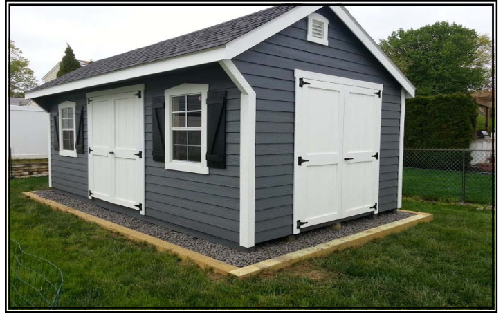
Crushed Stone pad with 1 Layer 6x6 perimeter