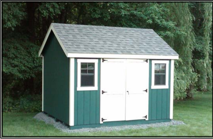
Standard Crushed Stone Pad