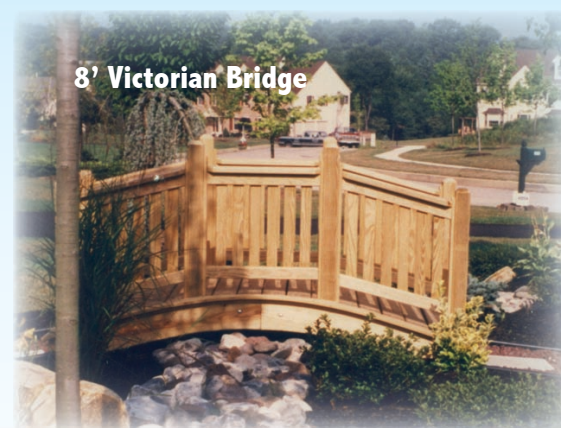
8' Victorian Bridge