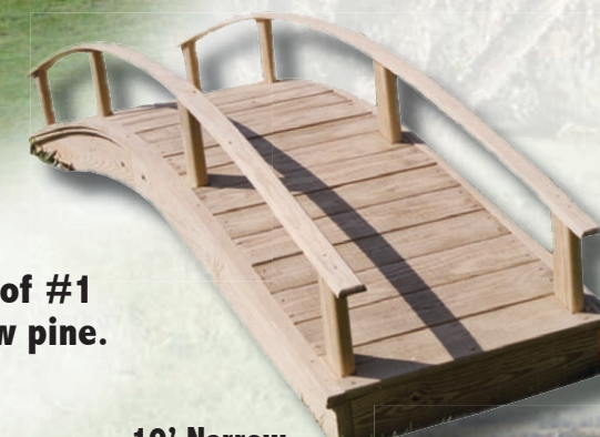
10' Narrow Japanese Bridge