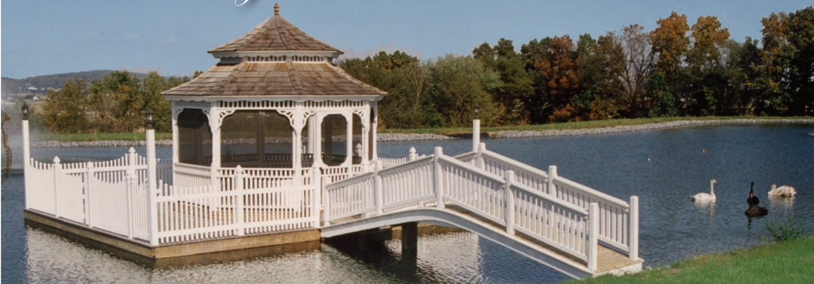
20' Victorian Bridge, painted