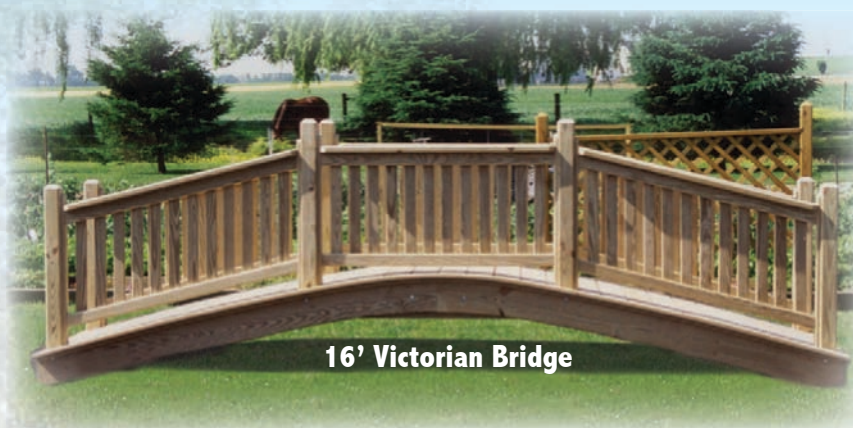
16' Victorian Bridge