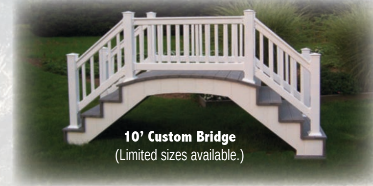
10' Custom Bridge (Limited sizes available.)