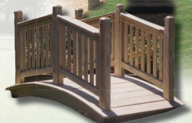
6' Victorian Bridge