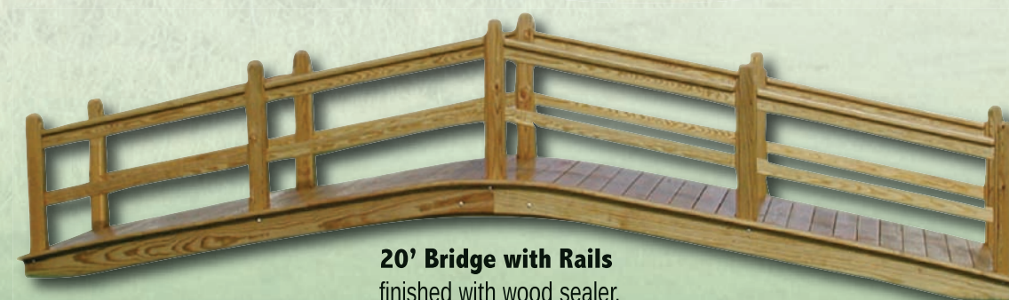
20' Bridge with Rails finished with wood sealer.