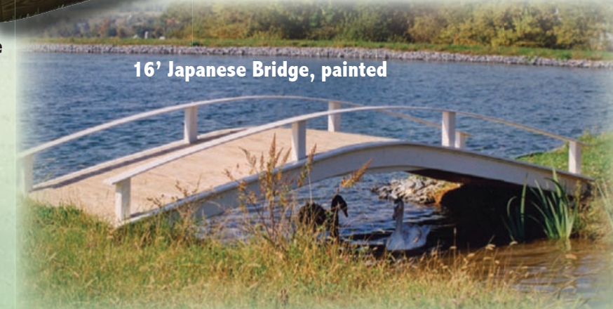
16' Japanese Bridge, painted