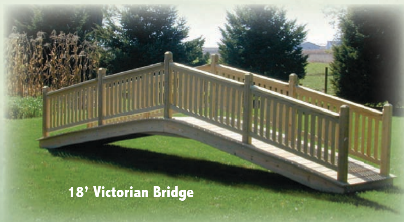
18' Victorian Bridge