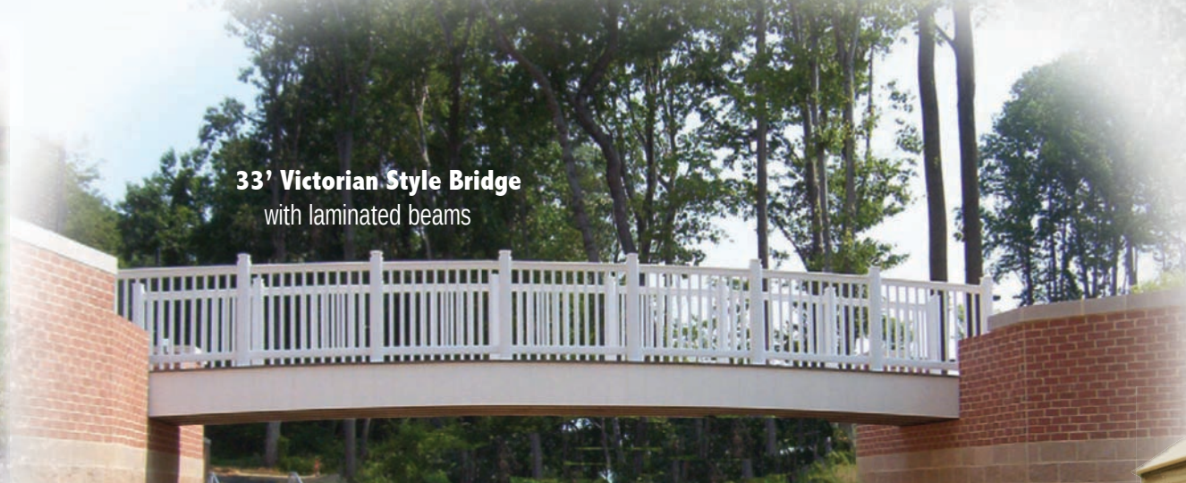
33' Victorian Style Bridge with laminated beams