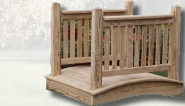
4' Victorian Bridge