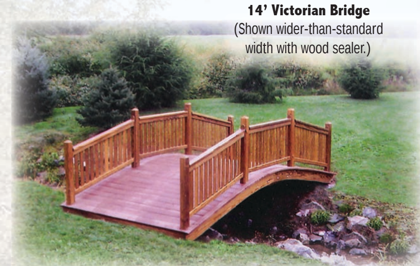
14' Victorian Bridge (Shown wider-than-standard width with wood sealer.)