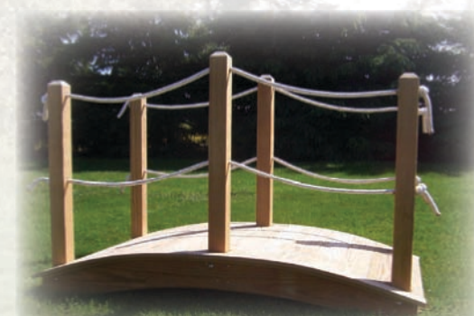
6' Rope Bridge