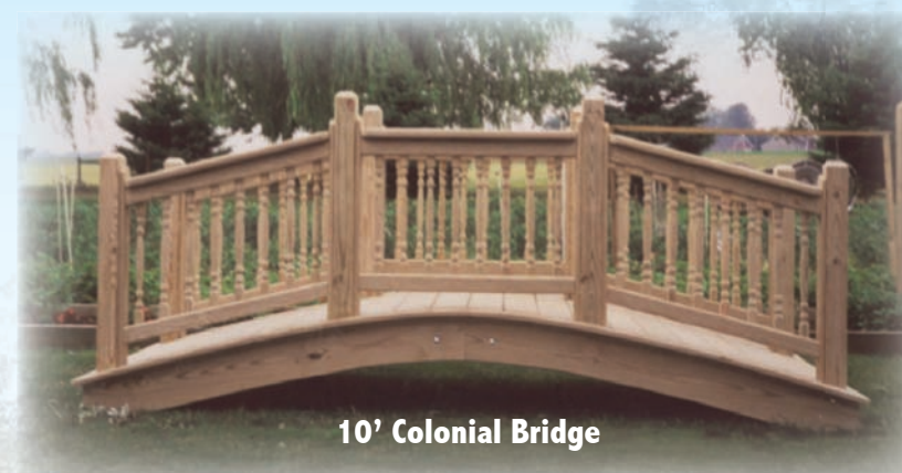
10' Colonial Bridge