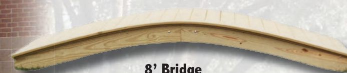
8' Bridge without railing