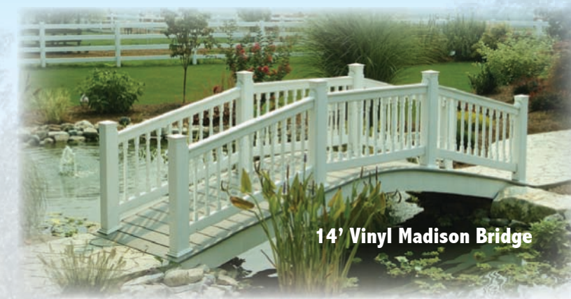
14' Vinyl Madison Bridge